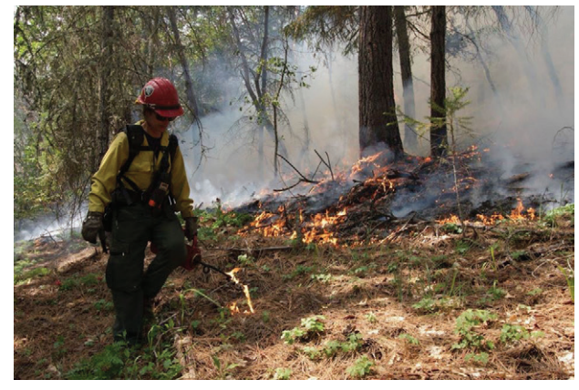
PRESCRIBED FIRE IS KEY TO ADAPTATION IN THE KS.

It is no secret that we need to take action on climate change. We need to reduce carbon pollution and we need to do it right away. When KS Wild took a hard look at climate change in our region, we realized it is the biggest threat to our world-class rivers and exceptional wild places. We now know that we need to develop immediate strategies to directly address how climate change will impact our corner of the world.