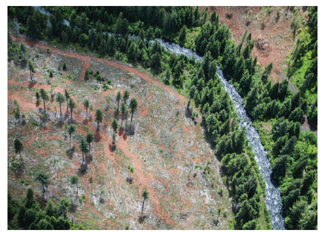
BIG BUTTE CREEK IN THE UPPER ROGUE WATERSHED.

Rogue Riverkeeper, a program of KS Wild, has been leading the charge in support of strong protections for streams in southern Oregon since 2016. Currently, streams that support salmon and steelhead in the Roque are left with weaker protections than the rest of western Oregon under the Oregon Forest Practices Act. Roque Riverkeeper also joined with 20 other conservation organizations to submit a petition to the